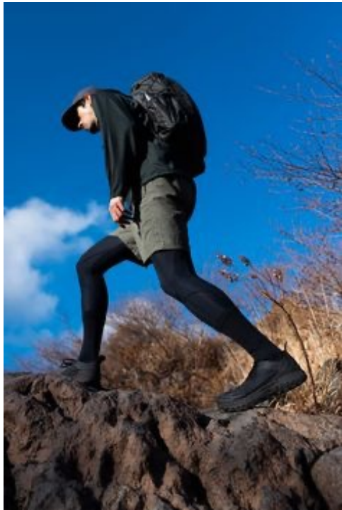
1/4 Zip Brushed Top and Hoodies

Trek Layers Mid weight support with stretch Brushed back for lightweight warmth 4 way stretch with spandex Wicks sweat away Breathable Zip pockets