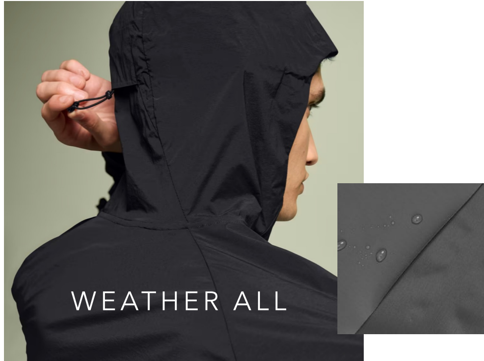
Sendi Weather All Shell Fabric Quality Alpha SV 20121-1 content and actual features?. 10,000 mm waterproof rating Lightweight and Packable Seam sealed waterproof seams Rain and wind proof