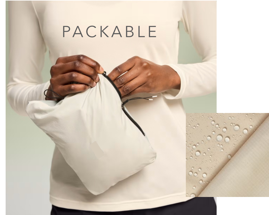
Sendi Packable Rain Jacket Fabric Quality Granville K1 #20120 Content and actual features? 5000 mm Waterproof rating Breathable Lightweight and Packable