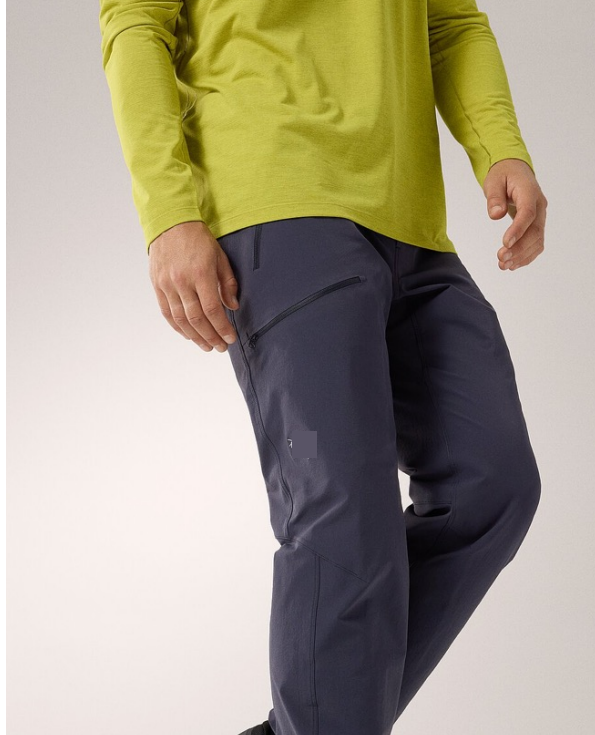
Outdoor Hiking Pants Sojourn N1 content? Water resistant Stain resistant UV Protection Breathable