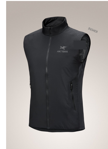
Illumination Jacket & Vest

Bonded seams in waterproof fabric Wind and Rainproof fabric Breathable Lightweight and Packable