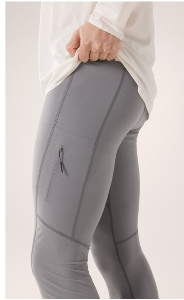
Brushed Back Leggings

Trek Layers Mid weight support with stretch Brushed back for lightweight warmth 4 way stretch with spandex Wicks sweat away Breathable Zip pockets