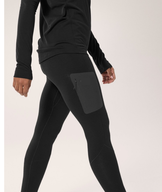
Outdoor Trek Leggings 82% Nylon 18% Spandex Cool smooth surface Brushed back warmth Stretch for maximum motion